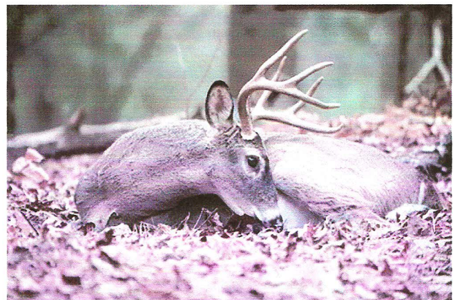
A buck just like this was seen outside our Second Reader's window. We have regular visits like this!

Our Reading Room has been servicing our remote friends by sending out items that they have